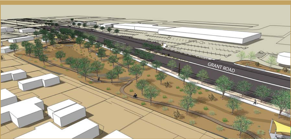
Perspective of Detention Basin looking northwest (approximate 5 year growth)