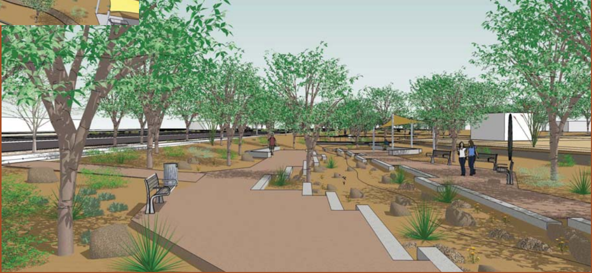
Perspective of Seating Area looking east from Hampton Street