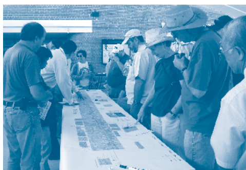
Citizens and Task Force members review Proposed Alignment Concept maps during the Open House at Catalina High School on October 18, 2008.

Several comments received included questions about billboards and utilities on Grant Road. Some billboards will be removed as a result of the alignment process. Signs located within (part or whole) the recommended alignments that do not conform to the existing sign code will ultimately be removed and can not be relocated unless brought into full code compliance. This is consistent with the City's Code and Policy. Regarding overhead utilities/poles/wires, the Regional Transportation Authority, which provides the funding for the Grant Road